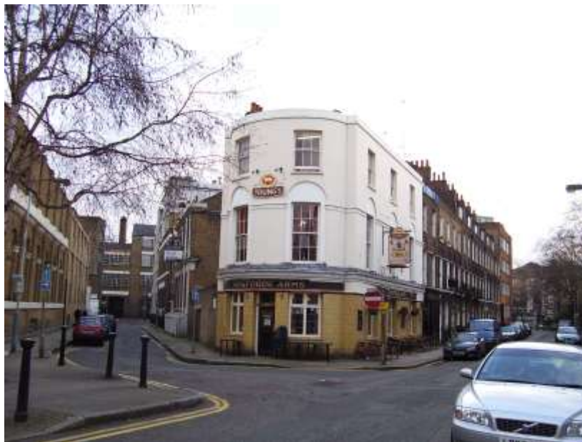
The Sekforde Arms, Clerkenwell. Not one of Bill's old haunts, but it is a Youngs pub!