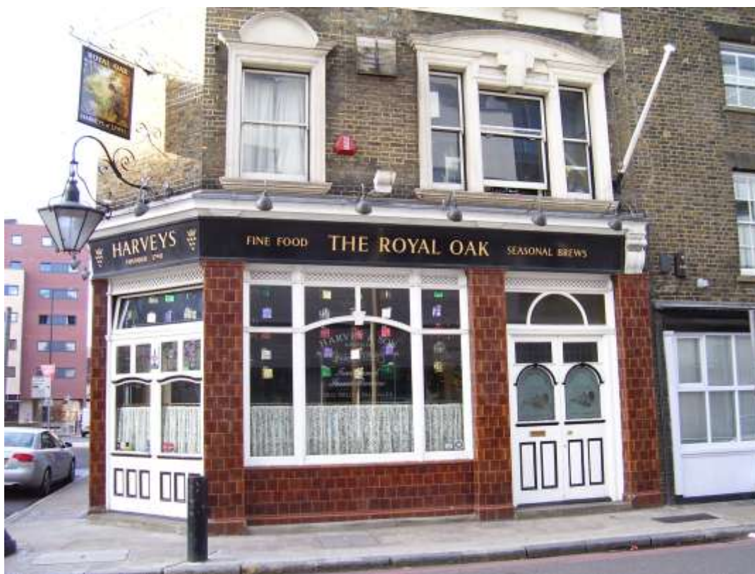
The Royal Oak, Southwark (with the Editor outside for a change!)